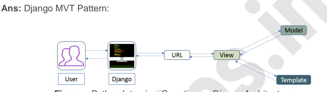
Figure: Python Interview Questions – Django Architecture

The developer provides the Model, the view and the template then just maps it to a URL and Django does the magic to serve it to the user.