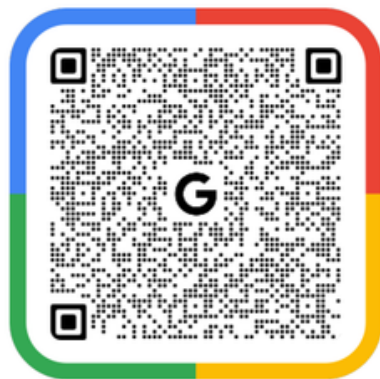
Indian Institute of Embedded Systems

Check Our Reviews, See How Many Students Got Placed & Find Our Institute Location – Scan the QR Code!